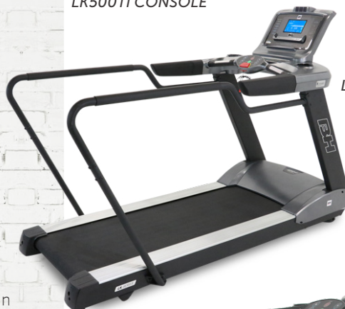
LK500Ti With Medrails